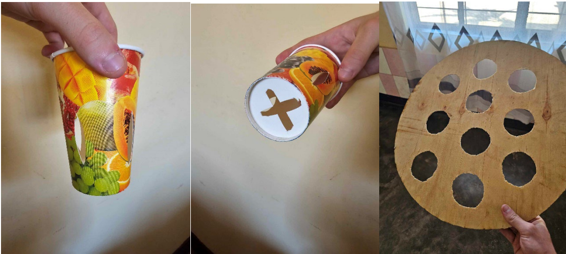
Appendix D – Pictures of step 3 and 4