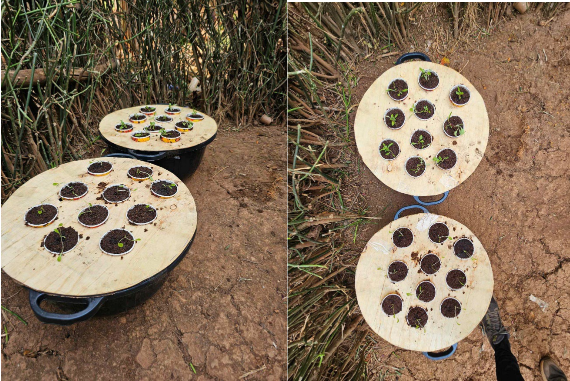
Appendix C – Picture of the system for swiss chard after setup