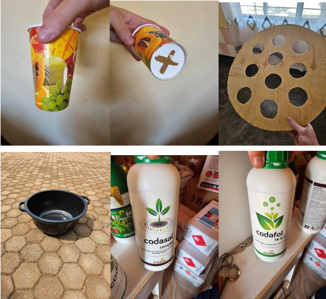
Appendix B – Pictures of materials for swiss chard