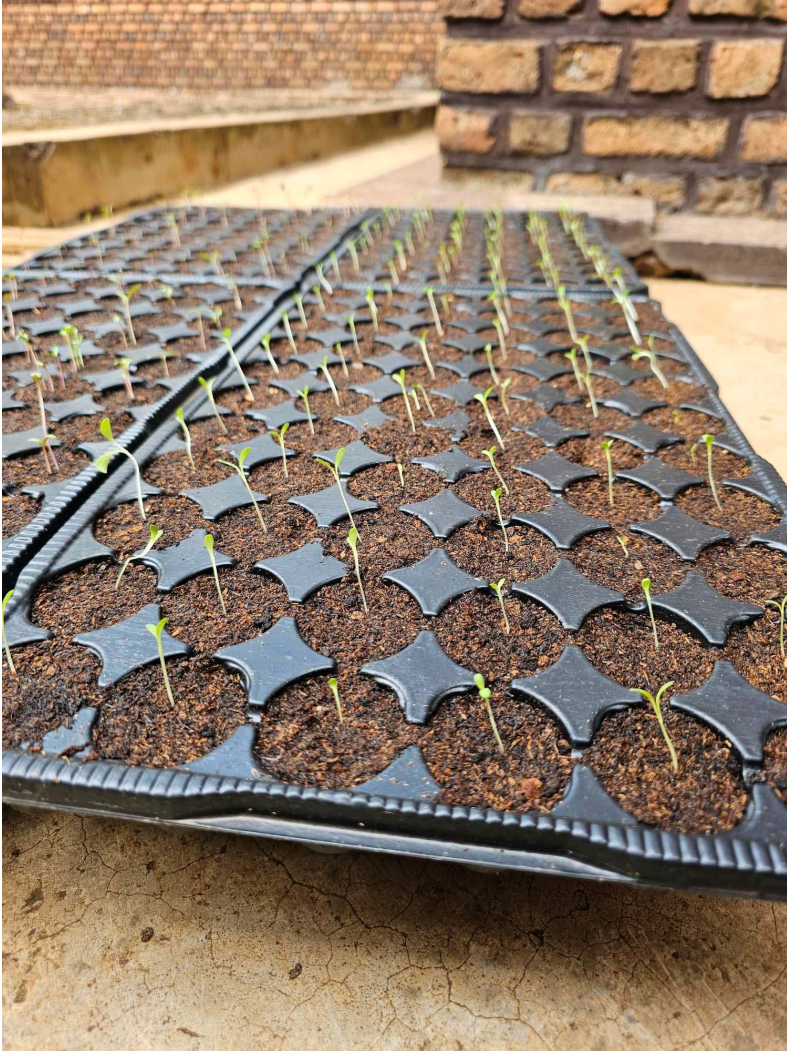
Appendix E - Germination